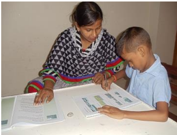
A one on one lesson with one of the more challenging pupils.

The curriculum also includes basic computer lessons that can improve the students' attention span and of course their reading and writing skills. Many are fascinated by the computer and absolutely love their sessions.