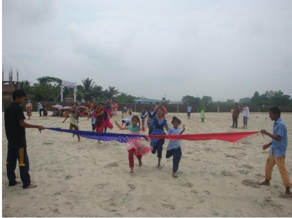
Regular sports events at nearby open spots, that are rapidly becoming more rare in ever growing Dhaka.