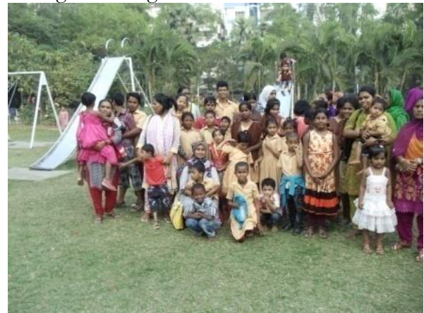
Regular outings to local parks and playgrounds with parents volunteering. The parents also befriend each other at these events. They for example organise chillsitting for each other when they are at work and the children at home.

The Perkins manuals are currently being translated into Bengali by our partner organisation and prepared for distribution throughout Bangladesh.